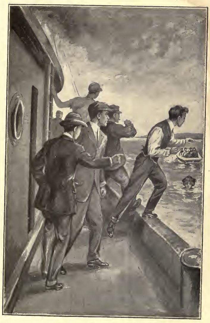
"THERE SHE IS!" CRIED TOM! AND THE NEXT INSTANT CAME A SPLASH, AS DICK MADE A DIVE OVERBOARD.—Page 283. The Rover Boys Down East.